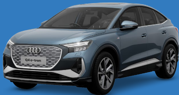
2025 Audi Q4 e-tron (Electric)

With over $370,000 in luxury vehicles to be won, soon you could be driving away in style.