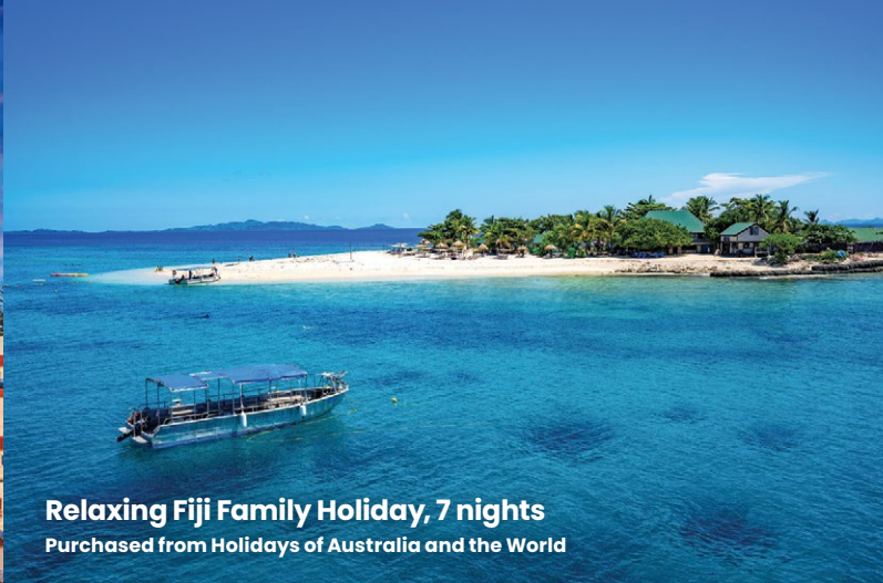
Relaxing Fiji Family Holiday, 7 nights Purchased from Holidays of Australia and the World