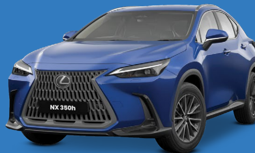
2025 Lexus NX 350h Luxury (Hybrid)