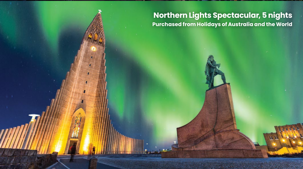
Northern Lights Spectacular, 5 nights Purchased from Holidays of Australia and the World