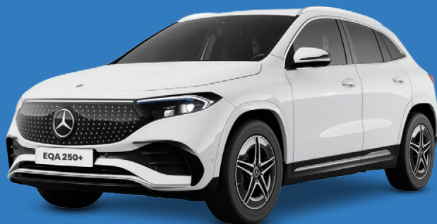
2025 Mercedes-Benz EQA 250+ (Electric)