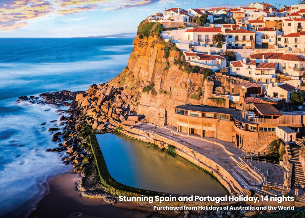
Stunning Spain and Portugal Holiday, 14 nights Purchased from Holidays of Australia and the World