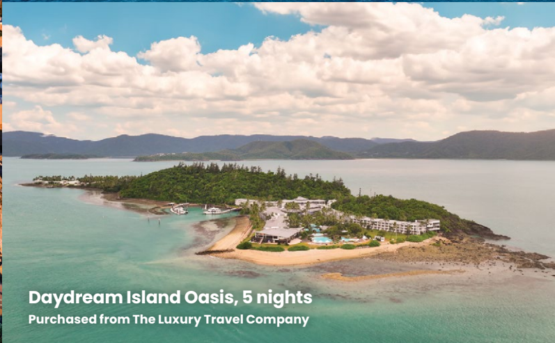
Daydream Island Oasis, 5 nights Purchased from The Luxury Travel Company