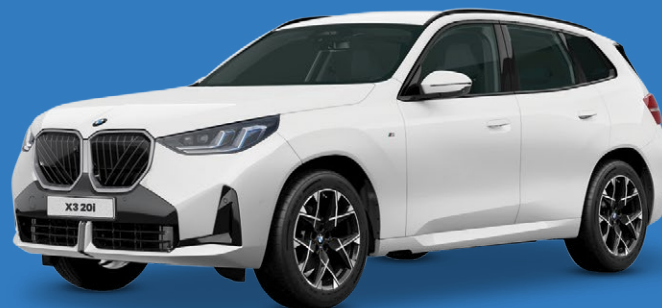
2025 BMW X3 20i xDrive (Hybrid)