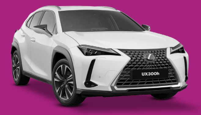
2025 Lexus UX300h Luxury EP (Hybrid) Purchased from Lexus of Adelaide