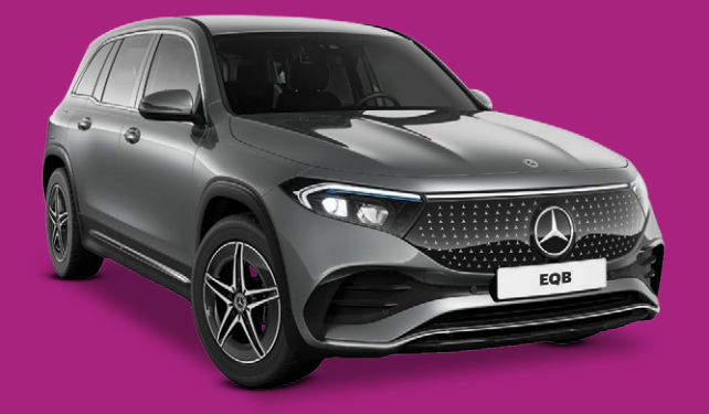
2025 Mercedes-Benz EQB 250+ (Electric) Purchased from Mercedes-Benz Adelaide

2025 Polestar 4 LRSM (Electric) Purchased from Polestar Adelaide